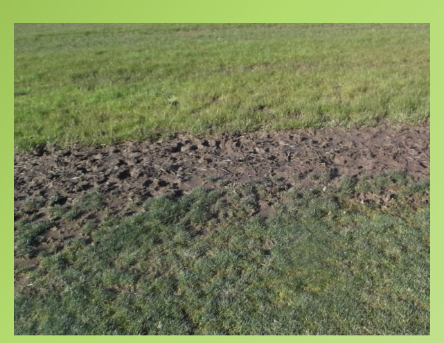
2-21 Runway mowed and rolled

Looks like the Elk have visited us again this winter. Lots of hoof impressions on the runway from the Geotex to the west end.